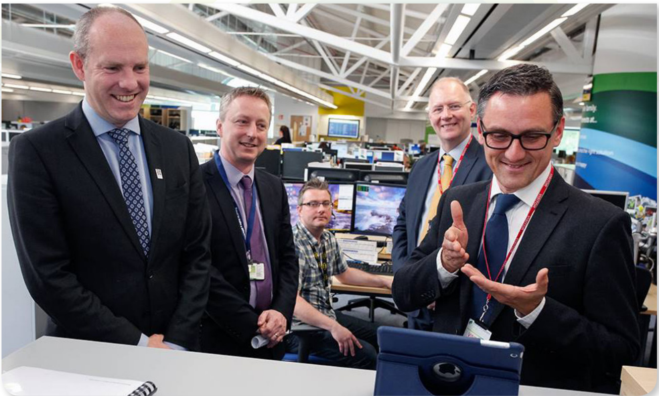
Justin Tomlinson MP, then Minister of State for Disabled People, tries out SSE's sign language service